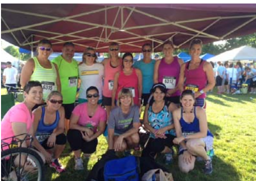
2014 Eden Corporate Challenge Team